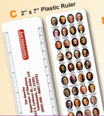
C 2" x 7" Plastic Ruler