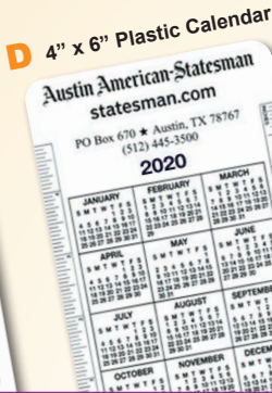
D 4" x 6" Plastic Calendar