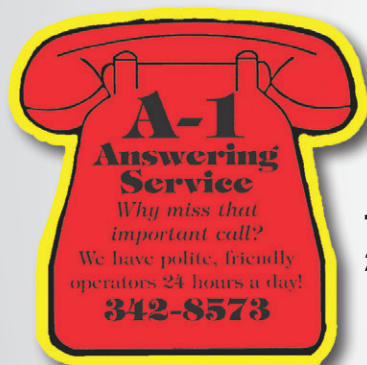
Telephone MA0354 2 7/8" x 2 7/8"