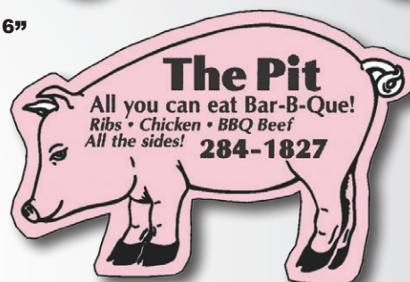
Pig MA0355 2" x 2 15/16"