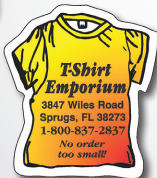
T-Shirt MA0357 2 13/16" x 2 1/2"