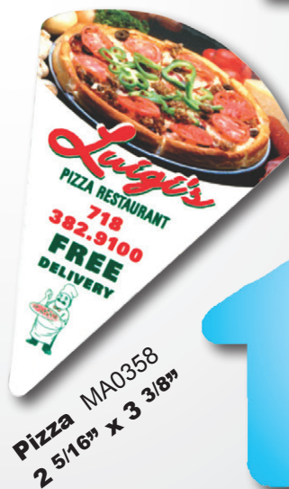
Pizza MA0358 2 5/16" x 3 3/8"