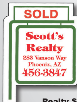
Realty Sign MA0356 1 7/8" x 2 1/2"