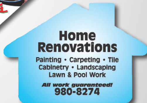
House MA0359 2 7/16" x 3 1/2"